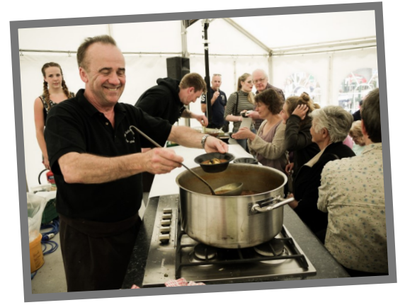
Great atmosphere at the Market during 2016 Festival